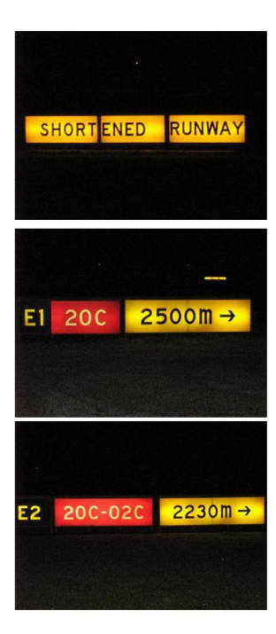
FIGURE 5 - Lighted sign at taxiway intersections