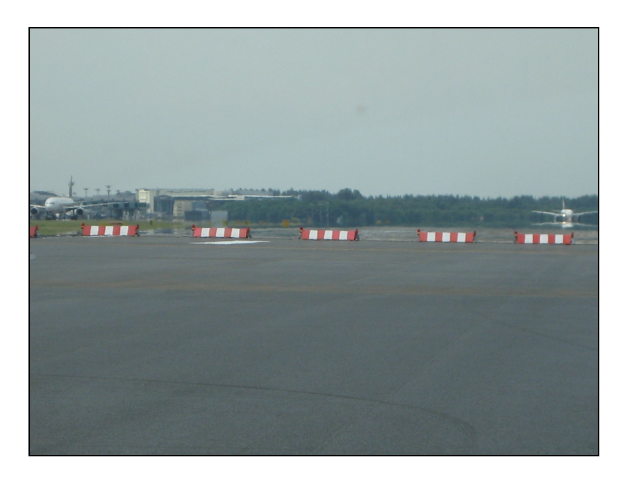
FIGURE 2 – A typical row of marker boards and lights, as placed at 260 m from the temporary runway end lights