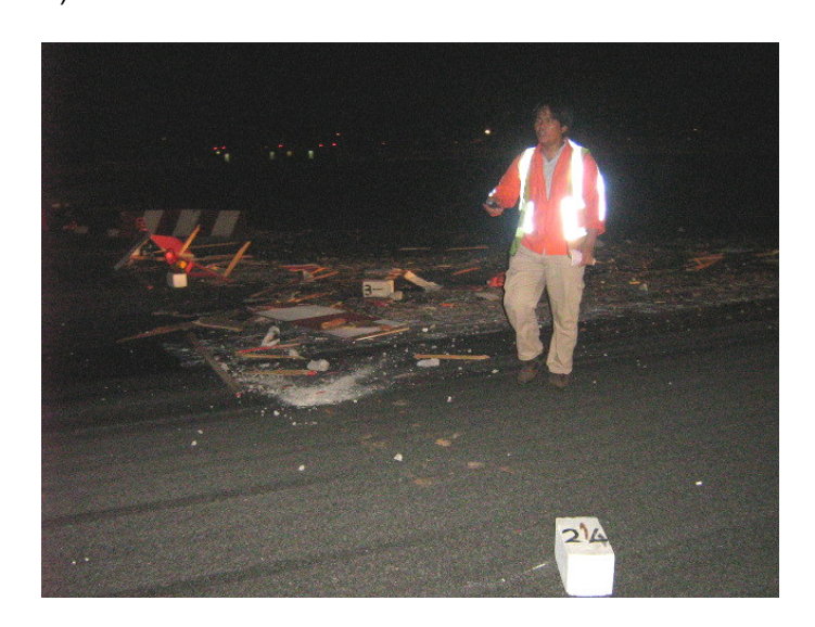
FIGURE 3 - Damaged marker boards and concrete blocks

1.4.1 The runway end marker boards and light assemblies were damaged. Of the 13 triangular marker boards that were laid across the runway at 260m from the runway end, 11 were destroyed and some<sup>5</sup> of the concrete blocks used to weigh down the boards were also damaged (See Figure 3 and Figure 4 ).