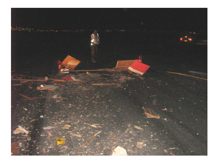
FIGURE 4 - Debris spread (photo taken against direction of take-off)