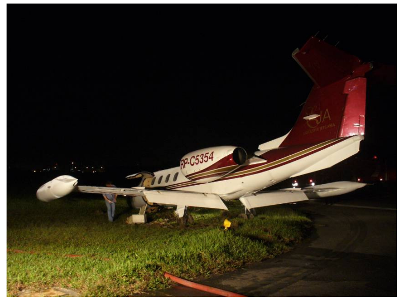
Figure 3. Aircraft on grass verge