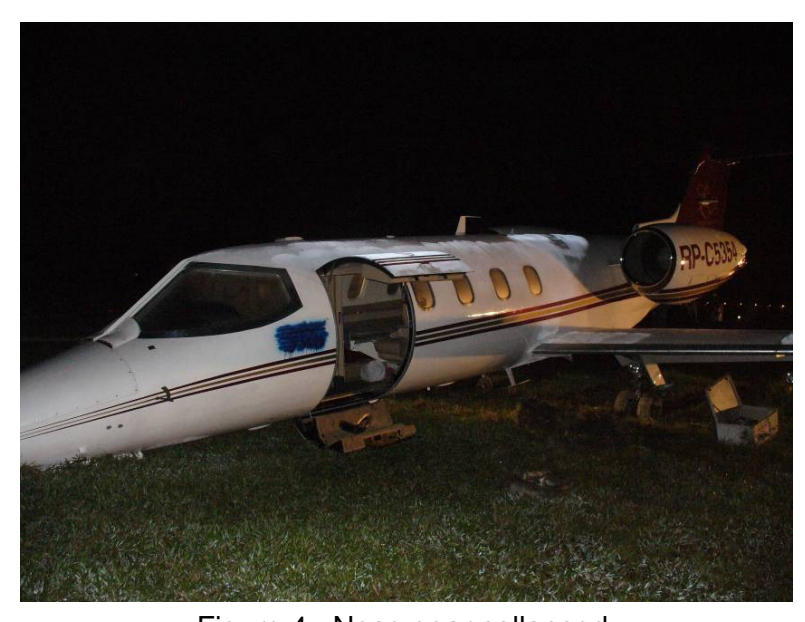
Figure 4. Nose gear collapsed

1.3.1 There was no fire. The aircraft suffered damage to the nose gear, nose gear doors, radome, nose lower structure, pilots' windshield. The nose, forward and aft fuselage of the aircraft had signs of wrinkled deformation. There were also crack marks on the ventral fin and the vertical stabiliser (see Figure 4 ).