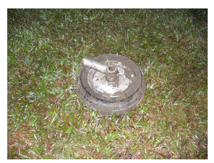
Figure 1. Aircraft nose wheel broken from its axle

1.1.9 The aircraft came to a stop at the intersection of Runway 03 and Taxiway W1 (see Figures 2 and 3 ).