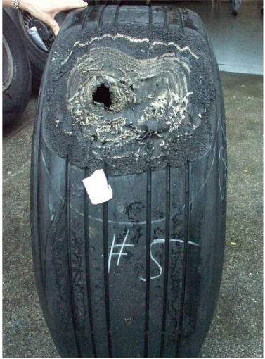
Tyre No. 5