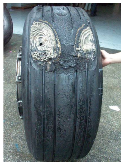
Tyre No. 1