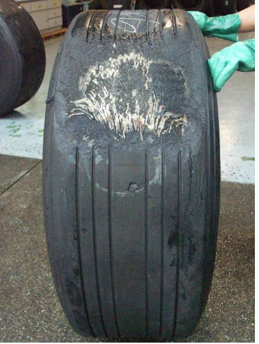
Tyre No. 6