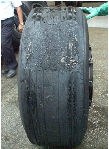
Tyre No. 2