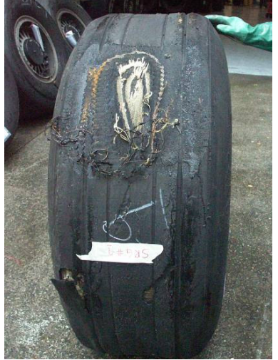
Tyre No. 9