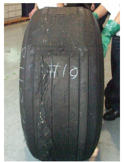
Tyre No. 10