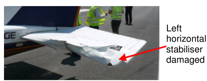
Figure 2: Damage of horizontal stabiliser