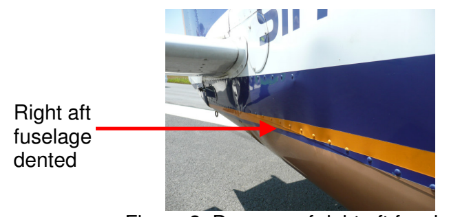
Figure 3: Damage of right aft fuselage

1 The pilot applied only 20 - 30% of full right rudder initially because he was wary of losing control of the aircraft if too much right rudder was applied. Although the student pilot gave an estimation of the percentage of the rudder input, it is important to note that the actual amount of control input cannot be measured.