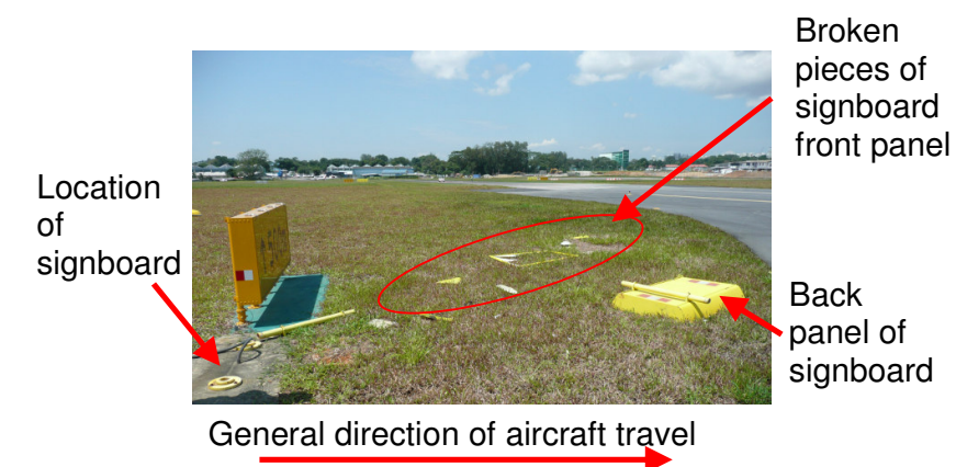
Figure 4: Echo Taxiway signboard damage