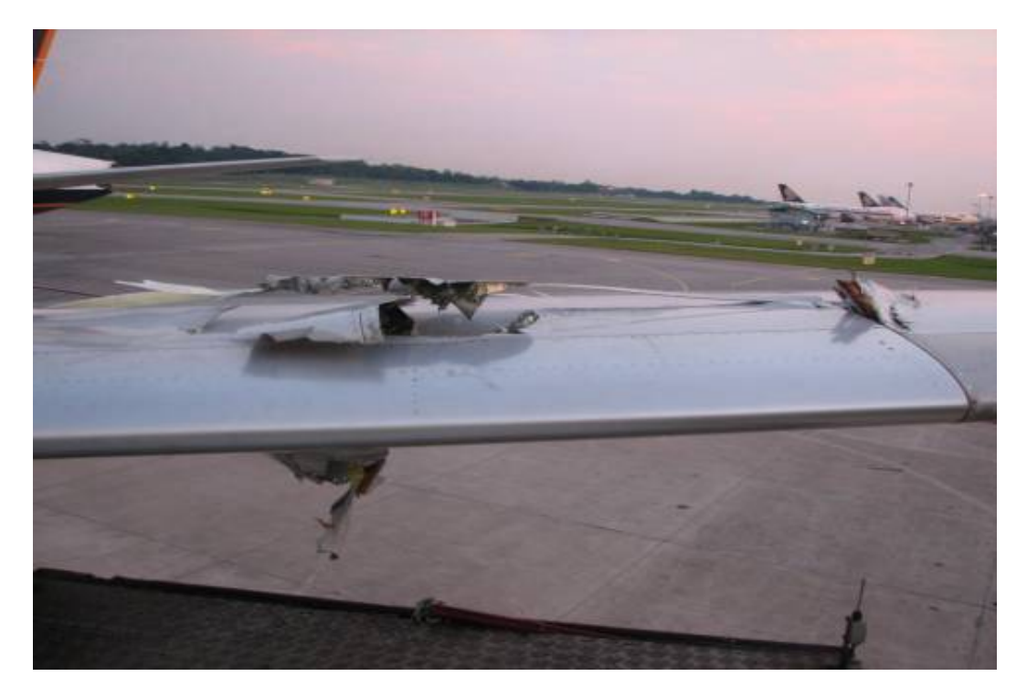
Figure 2. 9V-SVH damage at top of left wingtip area. View from front / above