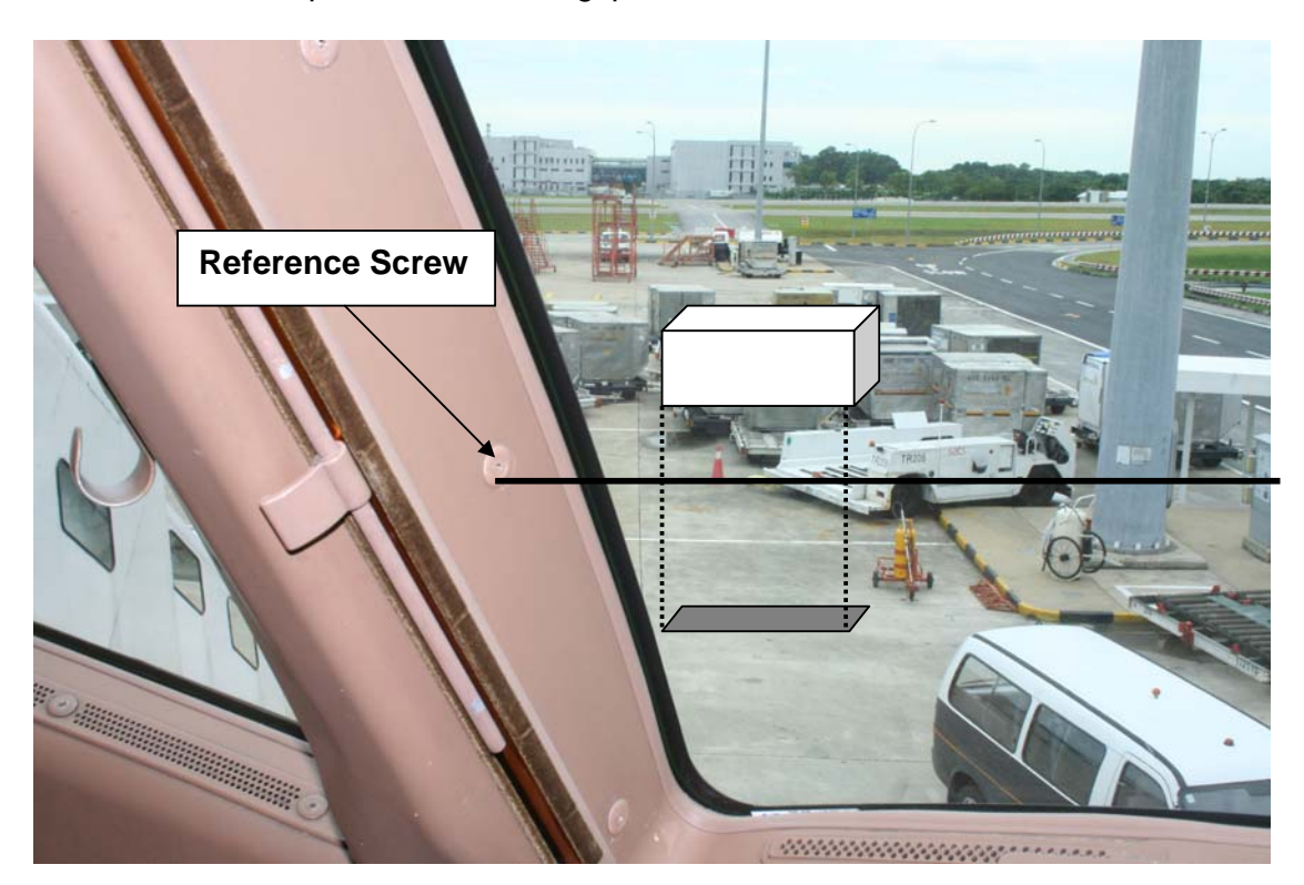
Figure 5 Mid-air object represented by the white box appears to be above reference screw.

clearance from objects not lying on the ground. If the object is in mid air, the technique would require the pilot to estimate the position of the object's ground shadow position in relation to the reference screw. For example, if the white box in Figure 5 represents a mid-air object within the wingspan distance from the cockpit, it will be wrong to conclude that it is outside the span of the wing just because it appears above the reference screw. The decision by the PIC of 9V-SVH to proceed with the taxiing was based on his seeing that the wingtip of the 9V-SVO was clearly above the reference screw, but he did not assess the ground shadow position of the wingtip, relative to the reference screw.