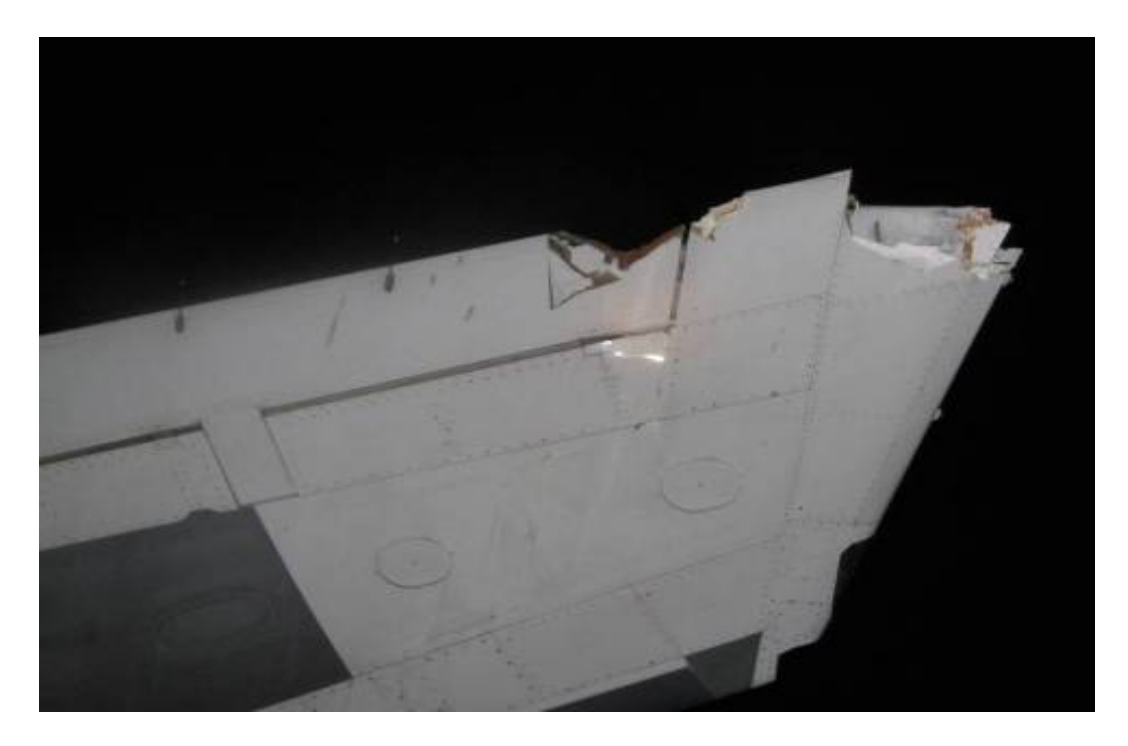
Figure 3. 9V-SVO damage at right wingtip and aileron. View from rear / below.