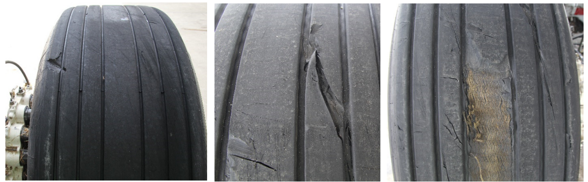
Examples of gouged and cut tyres