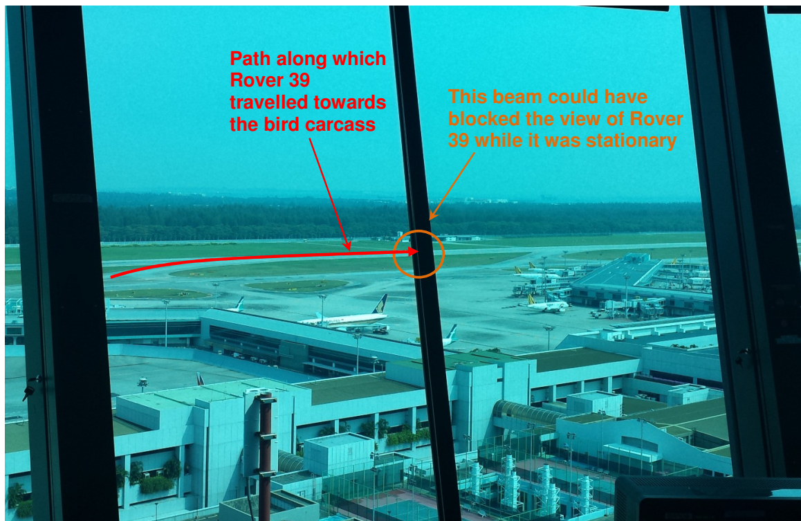
Figure 2: View from Controller 2's working position

2.4.2 Controller 2 did not use the A-SMGCS to double-check for the presence or absence of traffic on the runway. Had he referred to the A-SMGCS, there was a chance that he would see the runway incursion visual warning.