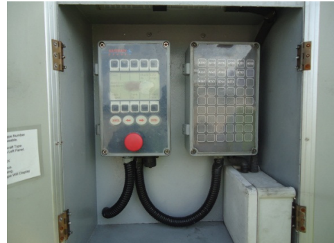
Figure 3: 30-key (L) and 54-key (R) operator panel