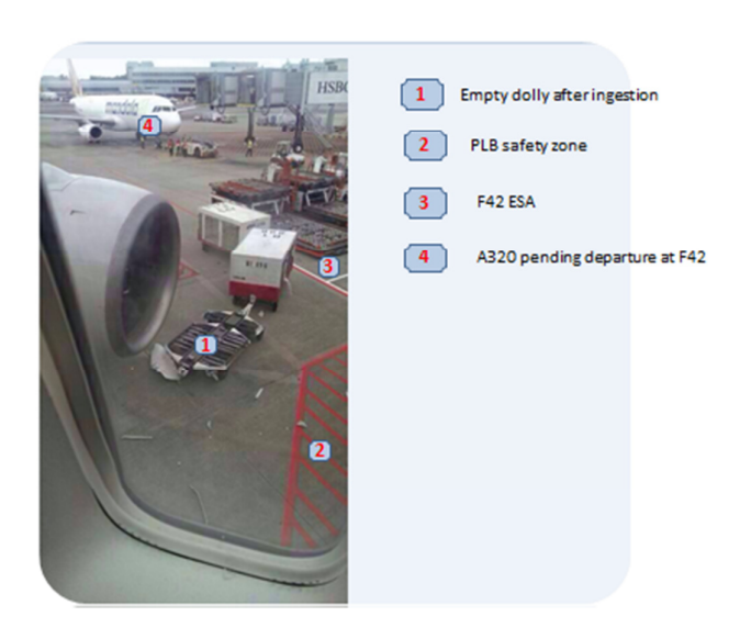
Figure 1: Empty dolly and surroundings after the incident

1.1.1 On 19 December 2013 at about 1645 hours, the Boeing B777 aircraft (registration 9V-SRP) ingested an empty cargo container (which was sitting on a dolly¹) into its left engine while docking at bay F37 at Changi Airport after arrival from Mumbai (see Figure 1 ). The engine sustained serious damage and had to be replaced. There was no injury to any person.