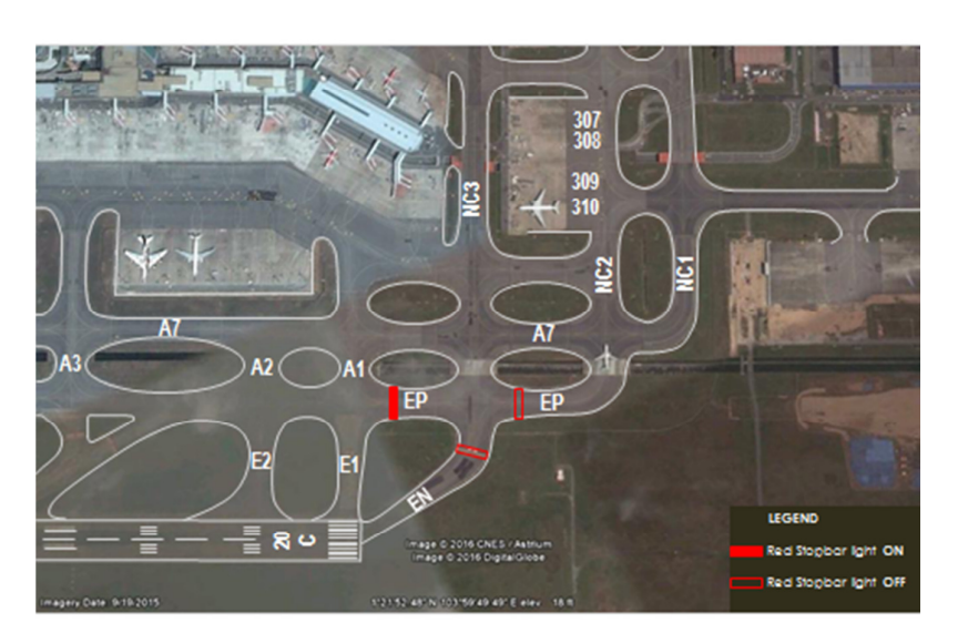
Figure 1: Taxiways NC2 and NC3 leading to R20C via EN

A specified geographical location along the flight path of an aircraft between two ATC centres.