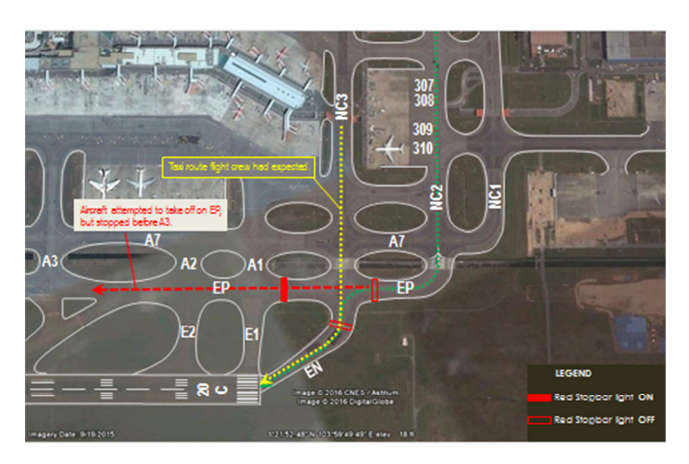
Figure 2: Taxiway centerline lights (in green), ground path of aircraft (in red), and taxi route expected by the flight crew (in yellow).

1.1.9 Figure 2 shows the selected "taxi on the greens" taxiway centerline lights (in green), the actual path of the aircraft towards EP (in red), and the taxi route (in yellow) expected by the flight crew.