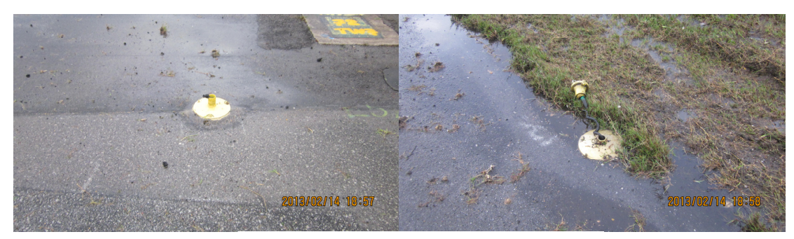
Figure 6: Damaged runway/taxiway lights

1.4.1. Five runway edge lights and four rapid exit taxiway edge lights along Runway 02L were damaged ( Figure 6 ).