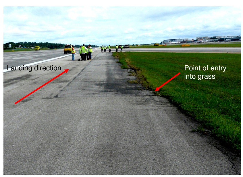
Figure 2: Wheel track of the right main