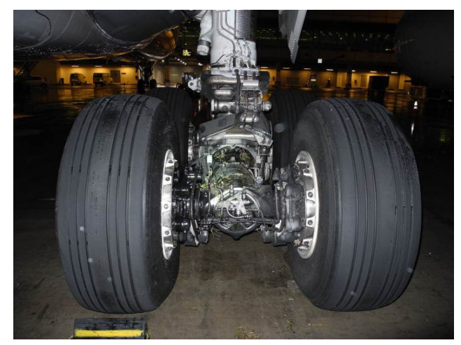
Figure 4: Grass ingestion on the aft of the right main landing gear