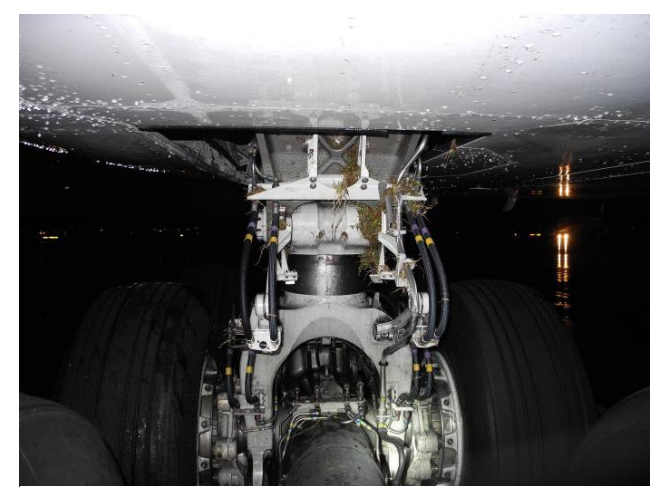
Figure 3: Grass ingestion on the forward of the right main landing gear