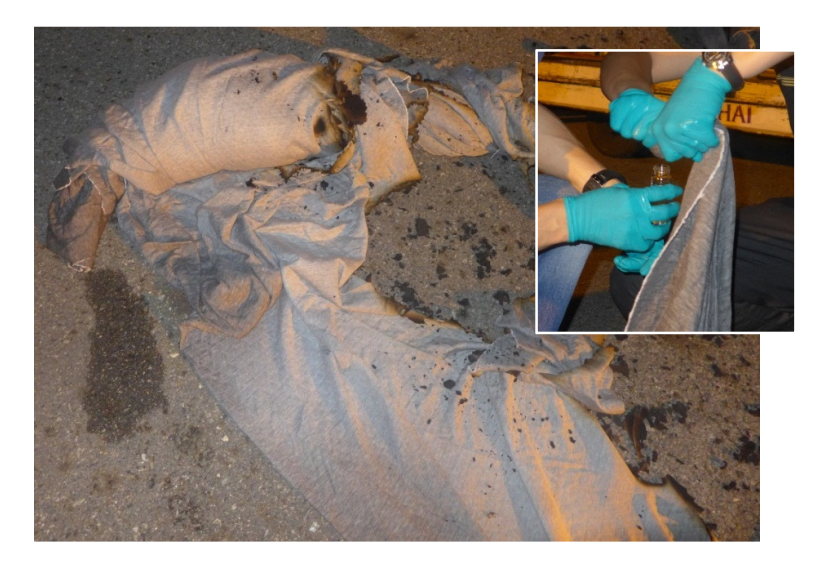
Figure 3: The bale of fabric heavily soaked in alcohol-like fluid. (Inset: Fluid being collected by squeezing the sample of fabric)

1.7.1.3 The investigators also found a damaged bale of fabric that was heavily soaked with an alcohol-like fluid. The investigators cut a sample from the bale and managed to collect a small quantity of the alcohol-like fluid by squeezing the sample (see Figure 3 ).