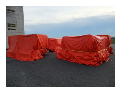
Figure 1: Cargo containers and pallets protected with plastic covers pending examination

1.7.1.2 The investigators and fire experts examined the cargo containers and pallets on 24 April 2013 and identified an area in the lower middle part of container 42L which they believed was where the fire had originated (see Figure 2). Samples of fire debris around this area were collected by the investigators.