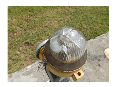
Figure 2. Approach light with broken top cover