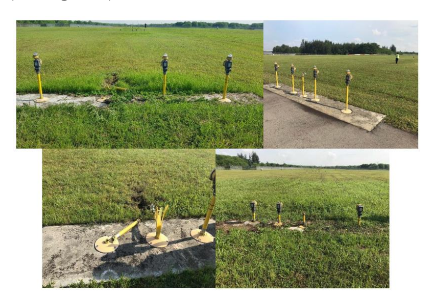
Figure 1. Damaged approach lights