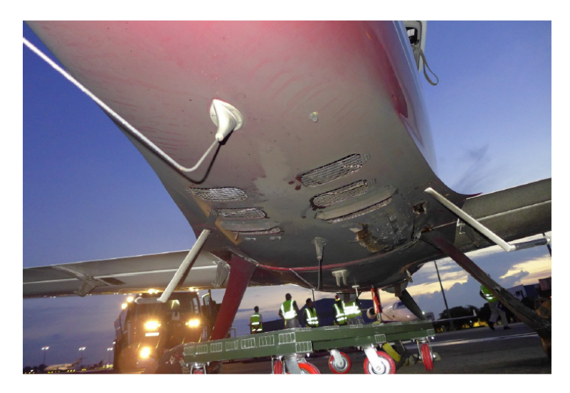
Figure 5: Heat damage on the lower fuselage of aircraft