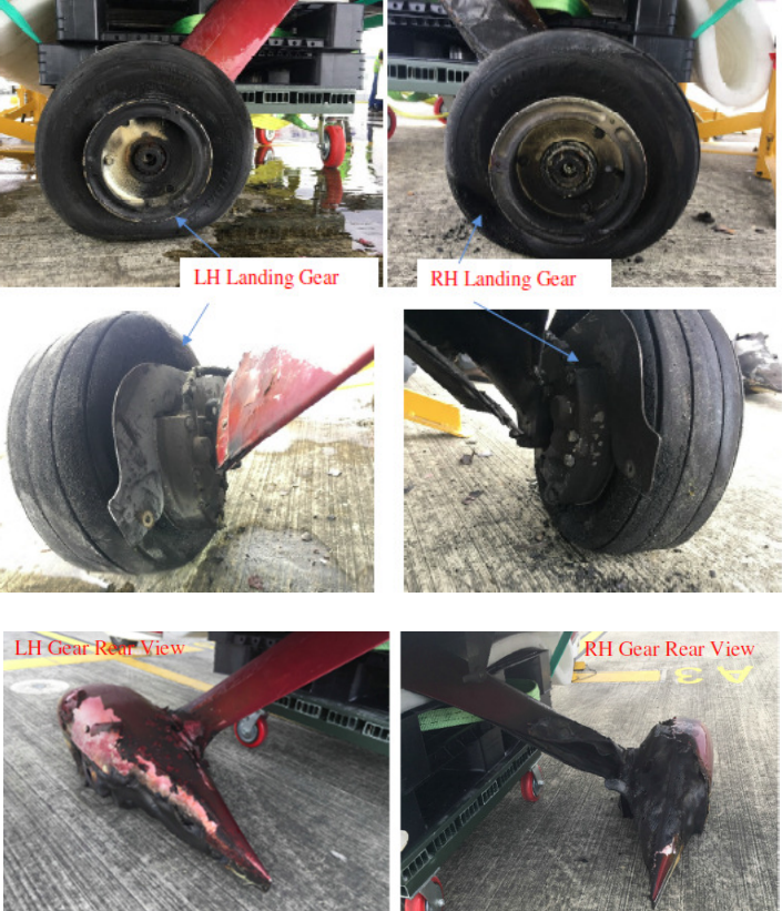
Figure 4: Damage to the landing gears

• The right side of the lower fuselage sustained more heat damage than the left side, including some blistering of paint (see Figure 5 ).