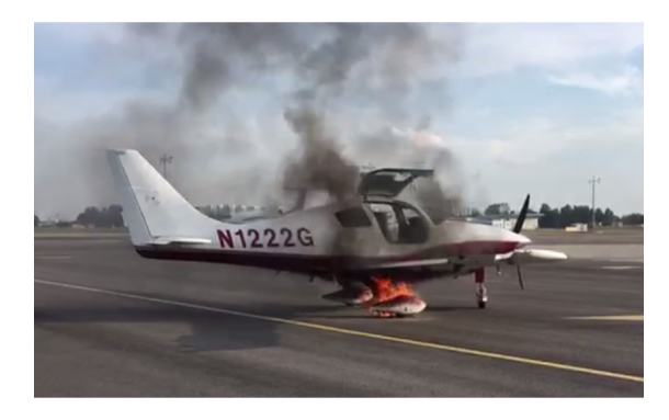
Figure 3: Fire at the main landing gears of the aircraft

1.1.11 After the aircraft had stopped, there was smoke from the main landing gears. The tow crew of the jet aircraft that was being towed into parking bay B2 saw a fire on the right main landing gear of the Cessna 350 and quickly brought a powder extinguisher over to the aircraft and discharged it at the main landing gears. The fire was not extinguished. At about the same time, the pilot noticed a burning smell in the cockpit and ordered an evacuation. After the pilot and the A&P mechanic had evacuated from the aircraft, both main landing gears caught fire, which generated black smoke (see Figure 3 ).