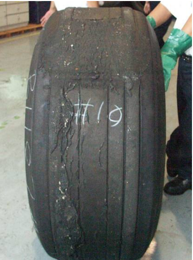
Tyre No. 10