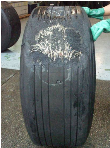
Tyre No. 6