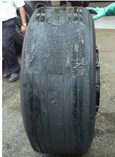
Tyre No. 2