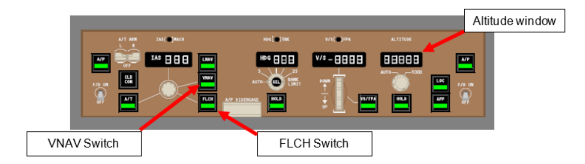
Figure 4. Picture (for illustration purpose) of MCP