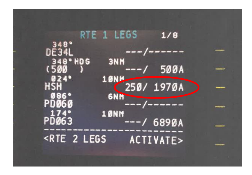
Figure 1. Picture reconstruction (for illustration purpose) showing the programmed speed/altitude constraint of "250/1970A" on SID HSN 22X