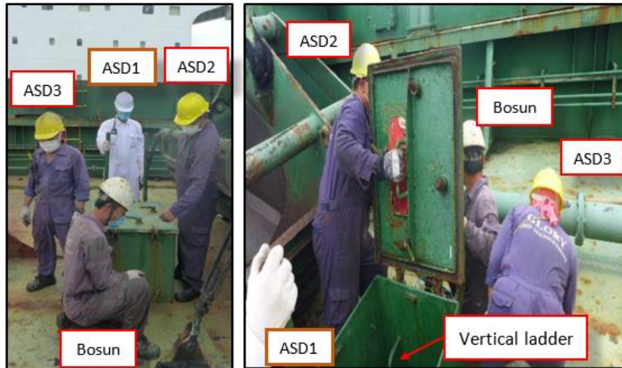
Figure 3 - Enactment of the positions of the deck crew

in open position, the ASD1 used a hammer to strike the internal dog handle of the other set of seized-up dog handles. After a few strikes, the external dog handle dropped onto the main deck and was picked up by the ASD3. Figure 3 shows the enactment of the crew's positions at the booby hatch freeing up the dog handles prior to the external dog handle dropping on deck.