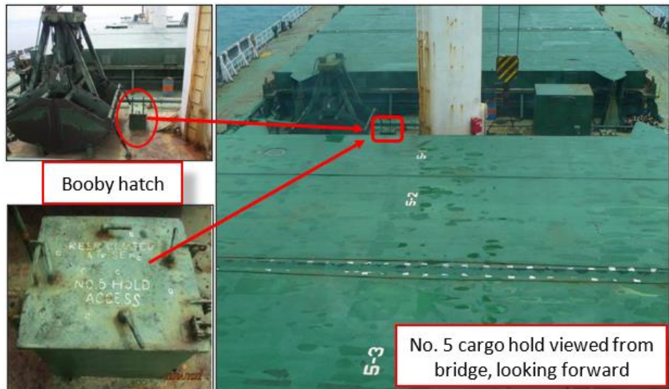
Figure 2 - No.5 cargo hold forward booby hatch - Source: the Company (Annotated by the TSIB)

1.1.4 The Bosun and the three ASDs transferred the grease and tools to the forward booby hatch (for accessing No.5 cargo hold, see figure 2 ). While turning the external dog handles to open the booby hatch cover, two out of the four were found to be seized. The deck crew used a short pipe to slot into the external dog handles and managed to turn them, and thereafter were able to lift open the booby hatch cover.