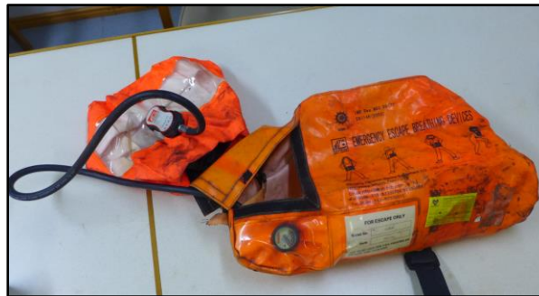
Figure 5 - EEBD set used by the 3O