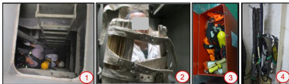
Figure 7 – Deployment of the SCBA, stretcher, rope and harness for the rescue drill (simulated at ship's duct keel)

1.7.2 According to the records obtained by the investigation team, a physical enclosed space entry drill was conducted at the duct keel on 10 October 2021, where the pre-entry checks and risk assessment were carried out, the SCBA, stretcher and other equipment (See figure 7 ) were deployed, the rescuing operation was simulated, and the outcome of the drill was documented as satisfactory. All the crew listed in the table (paragraph 1.3.2) participated in that drill.