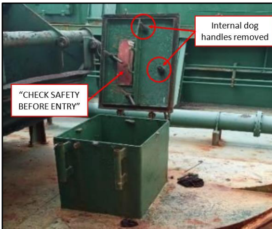
Figure 6 – The booby hatch cover for No.5 cargo hold

1.4.2 The outer side of the booby hatch was marked “KEEP CLOSE AT SEA” and “NO.5 HOLD ACCESS” (see figure 2 ). On the inner side, a red metal plate on the hatch marked the number of the cargo hold for access together with “CHECK SAFETY BEFORE ENTRY” (see figure 6 ). These markings were a part of the ship’s original design from the shipyard. There was no other sign or notice in the vicinity indicating that the cargo hold was an enclosed space or that the cargo hold was carrying coal at the material time.