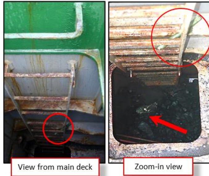
Figure 4 - Red-coloured circles indicating the dog handle and the arrow points to the safety shoes of ASD1 inside the cargo hold