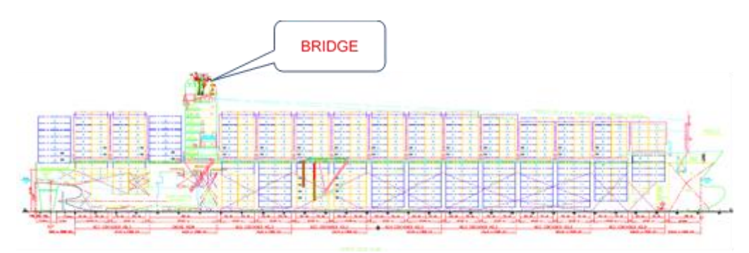
Figure 1 – Profile view of KL indicating location of the bridge

1.2.3 The layout of the bridge on Kota Lazim is typical of a ship of this size. The navigational equipment such as radars and the electronic chart display information system (ECDIS) are fitted in the forward part of the bridge while the global maritime distress safety system (GMDSS) related equipment are located at the aft part of the bridge, separated by curtains, drawn during the hours of darkness (see figure 2 ). When the Bosun came to the bridge the GMDSS was found undisturbed and in normal condition.