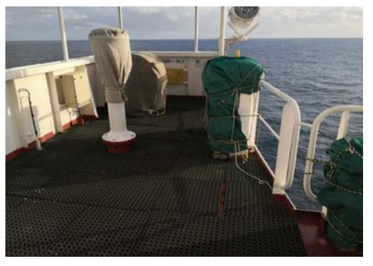
Figure 4 – The port bridge wing (left image) and starboard bridge wing – both viewed from the bridge – Source: The Company

1.2.6 At the time of occurrence, KL was drawing a draught of 11.9m forward and 12.2m aft, with a stern trim of 0.3m which was conventional to other similar type of ships. KL was manned by19 Chinese nationals including the Master.