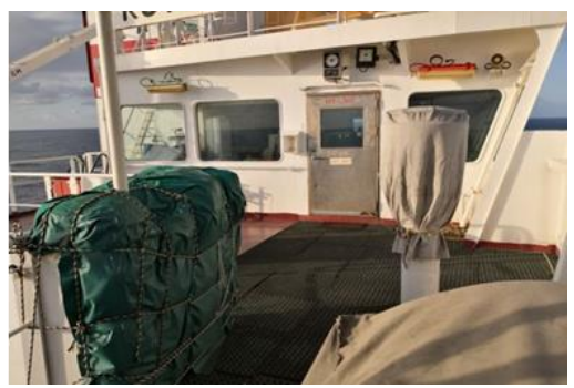
Figure 2 – View of the forward part of the bridge (left image) and the aft part (right image)

1.2.4 The bridge is connected to the bridge wings by two doors, one on each side, capable of being opened using a lever from inside and outside. Both the doors were found closed when the Bosun came to the bridge. The bridge wings extended to the ship's side and had rubber mats throughout (see figure 3 ).