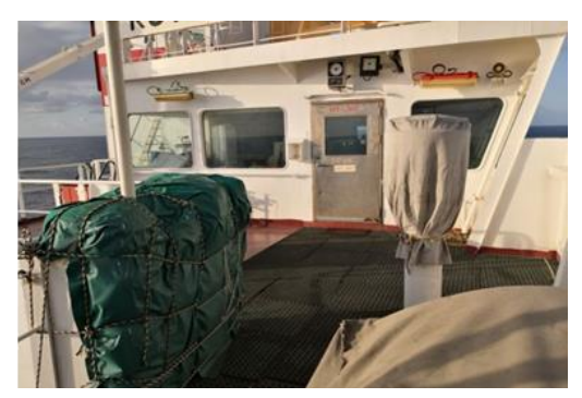
Figure 3 – View of the port bridge wing (left image) and starboard bridge wing – both looking towards the bridge – Source: The Company

1.2.5 The forward and side parts of the bridge wings are of continuous wind breaker<sup>10</sup> (protection from wind) while the aft part has railings, which are directly above the lower decks, again a standard design on ships of this size. According to the Company, there were no marks (of leaning over or footmarks on railings) that could indicate an accidental fall over any part of the wing.