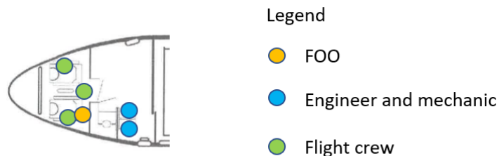
Figure 3: Aircraft seating arrangement