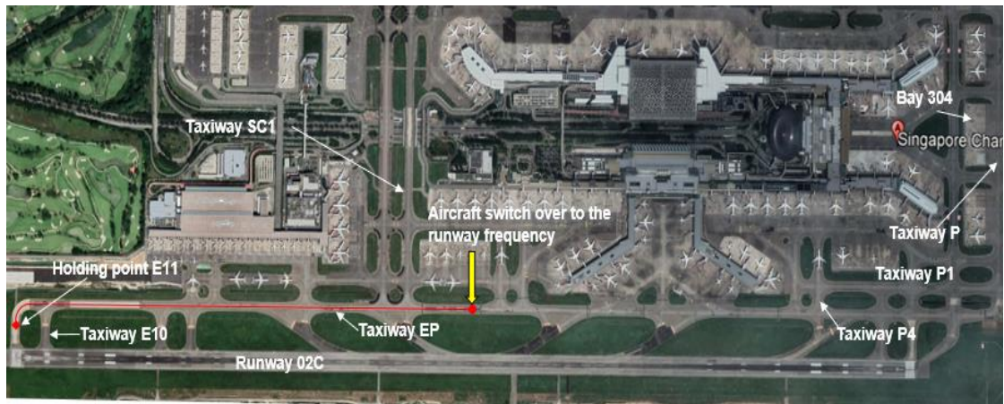
Figure 2: Overview of TMG019’s taxi route continuing from Taxiway EP (near SC1) to holding point on Taxiway E11