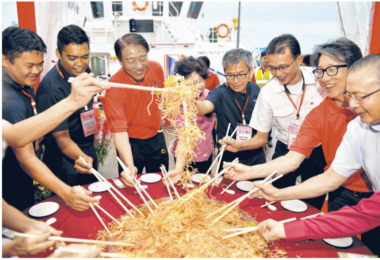
IN APPRECIATION: Acting Prime Minister Teo Chee Hean (third from left) tossing yu sheng with workers in the marine, marine transportation and port services sector yesterday.